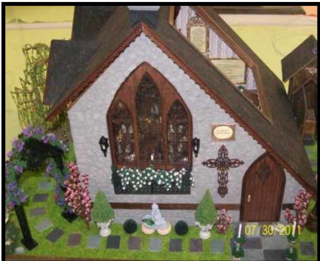
The Victorian Catholic School