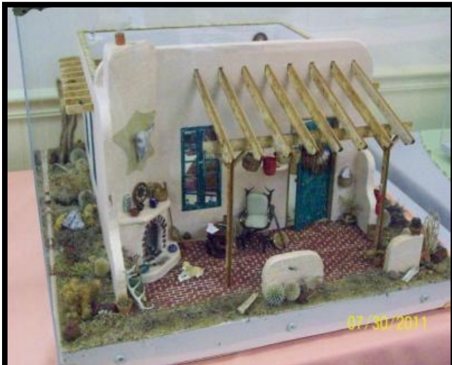
The Southwest Hacienda