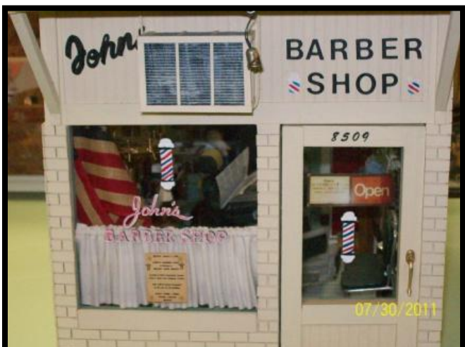
John's Barber Shop, Connecticut Ave, Chevy Chase

The attention to detail has every vignette looking like you could step in and live comfortably. There are clothes, food, working lights, plants, animals, furniture, and any number of other items in perfect miniature. It is truly a detailed and unique hobby that requires time and patience.