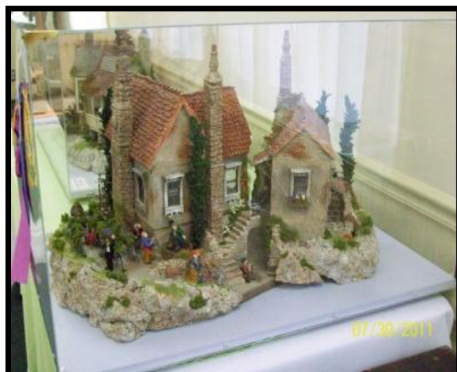
The Italian Winery

If you have not been in yet to see this wonderful collection, please come on in now as it closes on October 26. The detail is amazing.