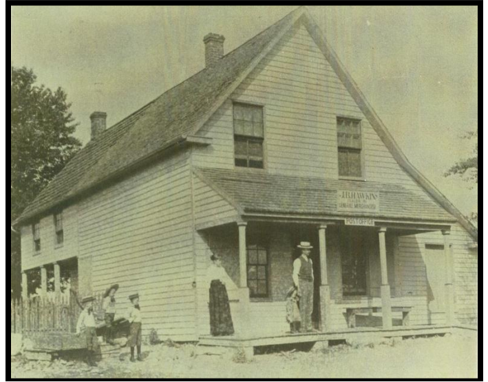
Everyone drives by this one.