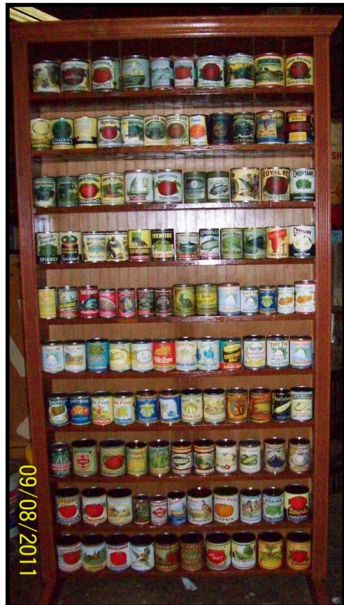
Just a small sampling of the cans from the Maryland canneries that are part of Gary's collection.

Gary's can collection is extensive and where better to display them than in an exhibit on country stores. So, in addition to the pictures and information about the country stores of the area, we will have numerous items found in these stores including many cans from the local canneries.