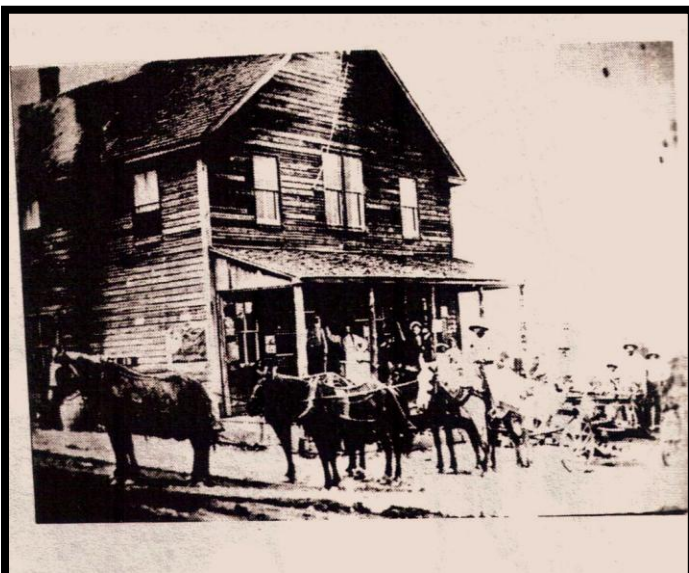
This is an old one but it is still there.