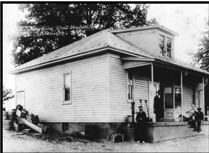
Maybe the shape of the building will give you a clue as it still looks the same today.